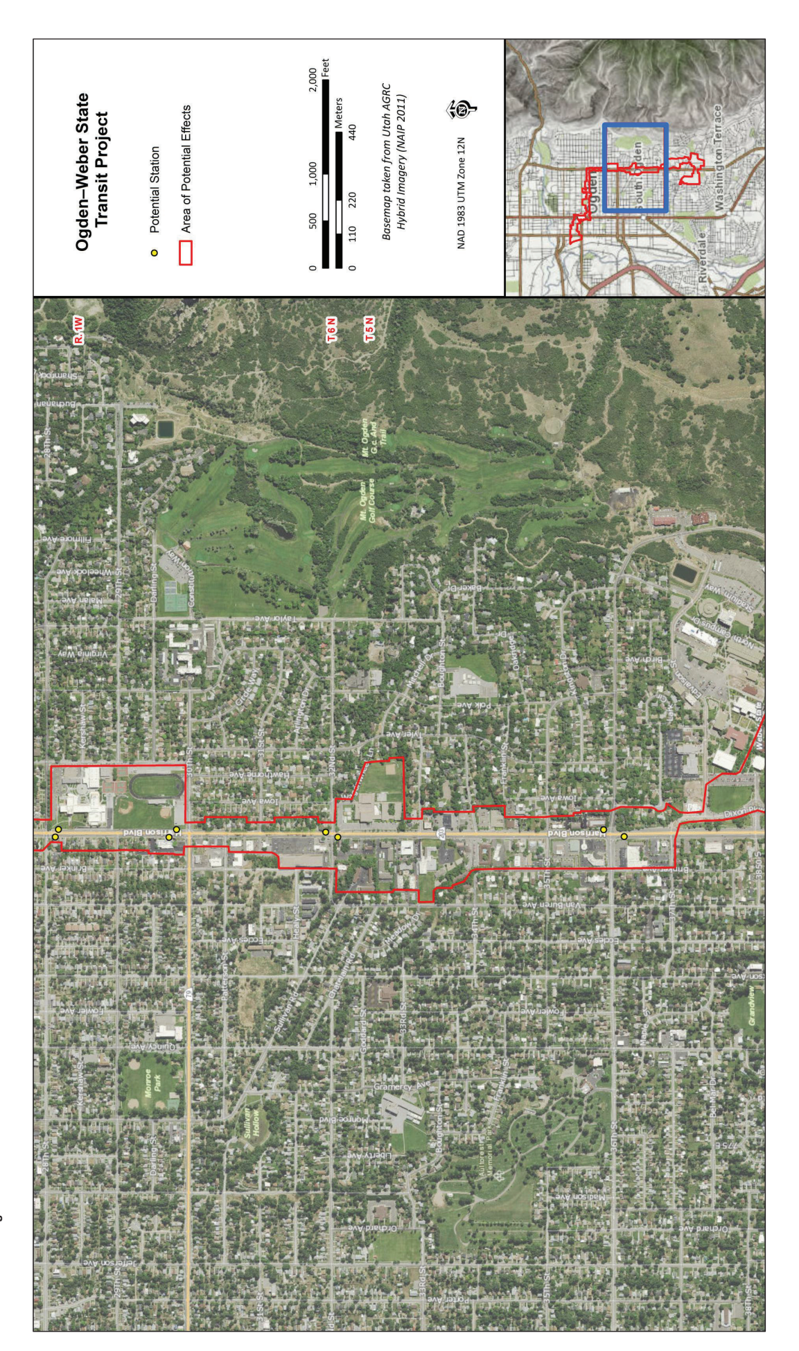
ATTACHMENT 2: Figures - Area of Potential Effects